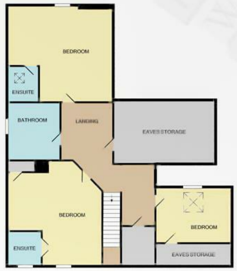
2ND FLOOR APPROX. FLOOR AREA 1233 SQ.FT. (114.4 SQ.M.)

TOTAL APPROX. FLOOR AREA 2666 SQ.FT. (247.2 SQ.M.)