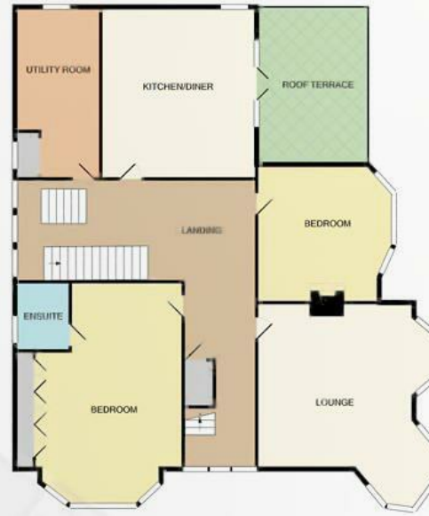
1ST FLOOR APPROX. FLOOR AREA 1433 SQ.FT. (132.8 SQ.M.)